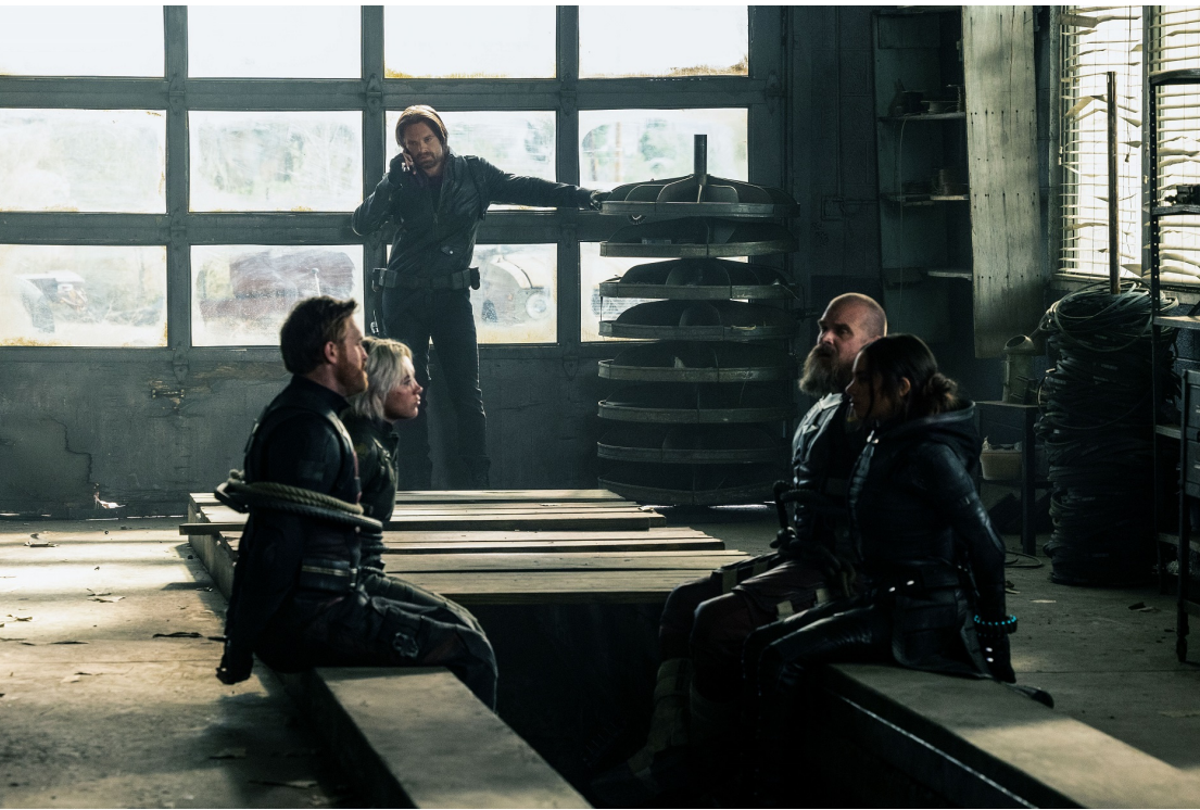
Marvel’s Studios’ Thunderbolts find themselves tied up with nowhere to go — except in theaters on May 2. (L-R) John Walker (Wyatt Russell), Yelena Belova (Florence Pugh), Bucky Barnes (Sebastian Stan), Alexei Shostakov / Red Guardian (David Harbour), and Ghost (Hannah John-Kamen).