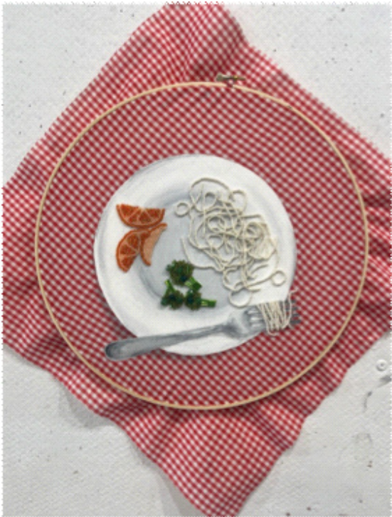
“Picky Eater” -- Jayna Klo Medium – Mixed Media Dimensions – 12.4-inch diameter